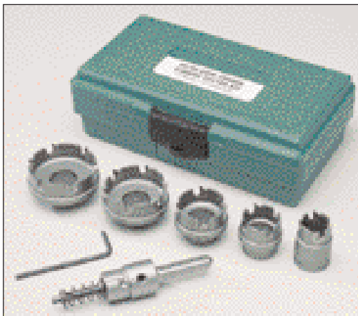
Kwik Change™ Stainless Steel Cutter Kit Cat No. 660/UPC No. 05766