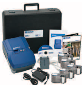
* BMP53 kit shown.