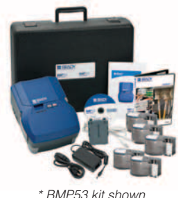
* BMP53 kit shown.