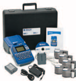
* BMP51 kit shown.