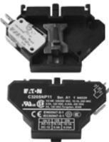
Side Mounted Snap Switch