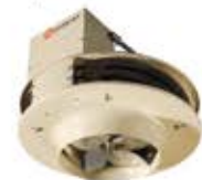
Vertical Unit Heater (Series OAV)

Designed to heat buildings with high ceilings. This vertical unit heater can be used to recirculate the warm air accumulated near ceilings.