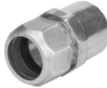
EMT to Rigid Wet Location Combination Coupling (290-RT)

Used to make transition from Rigid Metallic Conduit. IMC to EMT in wet and dry locations.