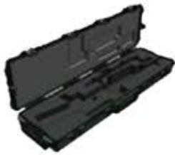
Single C8 (472PWCC8), C6 (472PWCC6), C9 (472PWCC9) & Accessories.