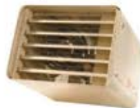
Commercial Industrial Suspended Unit Heater (Series OAS)

Designed for areas requiring a high level of air flow. This unit heater may be mounted horizontally or vertically. A variety of control options are available in kits.