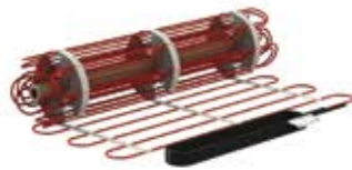
Heating Cable for Snow Melting on Mat (Series OWS-T)

Mat with flexible strips designed for outdoor applications. Simply unroll and voila! Eco-friendly, limiting the need for salt or sand.