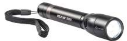
5010, 2AA, BLACK