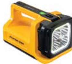
9050, LI-ION/AA SPOT+FLOOD LANTERN, YW