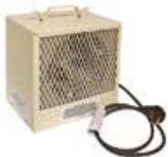
Portable Construction Heater (Series OCC)

Designed for workplaces requiring temporary back-up heating. Features a totally enclosed motor that prevents dust accumulation, thereby increasing the lifespan of the heater.