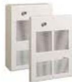
OAC Commercial Wall Fan Heater (Series OAC)

Provides a burst of heat in areas affected by cold drafts. Can be recessed or surface-mounted.