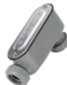
EMT Conduit Body With Integral Raintight Connector, Set Screw, Aluminum, (LB-42RT)

Allows access to the interior of a conduit system for inspection, pulling and maintenance, without needing to thread connectors into a conduit body entry. Type LB, 3/4".