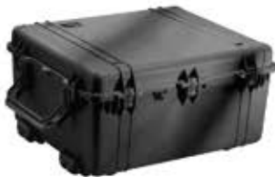
1690 WF BLACK Interior: 30.1 × 25.1 × 15.4", Exterior: 33.4 × 28.4 ×