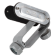
EMT Conduit Body With Integral Raintight Connector, Set Screw, Aluminum (LLR-42RT)

Bridgeport's LLR Conduit Bodies are Type LL/LR Combination conduit bodies with Integral Raintight Connectors. Type LLR, 3/4".