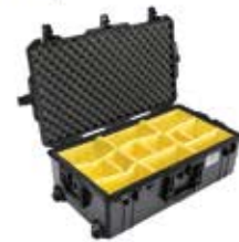
1615AIR WF BLACK Interior: 29.6 × 15.5 × 9.4", Exterior: 32.6 × 18.4 ×