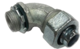
Connector, Liquid Tight (470-SLT)

90 Degree connector for use with metallic liquid tight conduit.