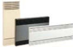
OCE European-Style Convector (OCEM0500-T600)

Comes in three different heights and can be equipped with a built-in electronic thermostat (TH) or teamed with a wall-mounted electronic thermostat (OTH).