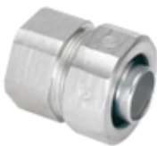
Transition Coupling, Rigid/IMC Conduit to Liquidtight FMC, 1/2 Inch, NPT Threads (4370-LT)

For creating a Liquidtight/Raintight Connection between 2 different Raceways: 1/2" Rigid Conduit (GRC & IMC) and 1/2" Liquidtight Flexible Metallic Conduit (LFMC).