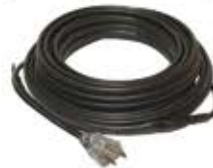
120V Preassembled Self-Regulating Heating Cable (Series OSR-PI)

Helps prevent roof damage and leaking caused by ice. Suitable for shingle, rubber/tar, wood, metal and plastic roofs as well as wood, metal and plastic gutters.