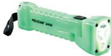
3410,RT ANGLE LIGHT LED-MGNTCLIP