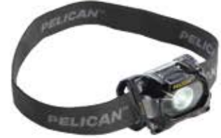
2750C,HEADLAMP,GEN3,BLACKFlexible Metallic Conduit (LFMC).