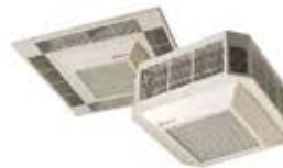
ODS Ceiling Fan Heater (Series ODS)

Driven by a powerful motor, the fan creates circulation by blowing the warm air accumulation near the ceilings downward.