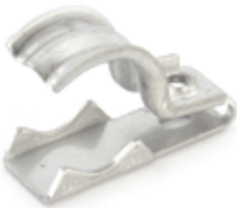
One piece clamp back and strap combination, 1 hole, Stainless Steel (UCSS-5075)

The one piece clamp back and strap secures both cable and conduit. 1/2" - 3/4" Trade Size.