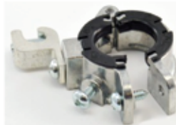
Mighty-Rite Split Grounding Bushings - Zinc Die Cast, Nylon Insulator, tin plated Aluminum alloy lug (SGB-382CL)

Used in situations where wires have already been pulled through conduit or EMT fittings, LUG #14-4 AWG 3/4, various sizes available.