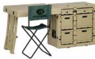
The Pelican roto molded single field desk provides one (1) flat desk working surface.