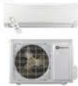
OTP-O Olympia Ductless Single Zone Heat Pump (UHD09KCH38SB-O)

Produces about four times more heat than a traditional electric heating system, as well as offering air conditioning.