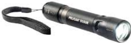
5050R, RECHARGEABLE, BLACK