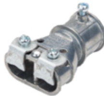
Mighty-Merge® Transition Fittings 3/4" EMT to Duplex AC/MC Coupling (4157-DC)

Set Screw type transitional fitting ideal for commercial and institutional facilities.