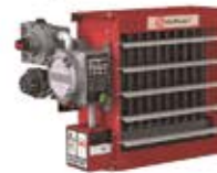
Explosion-Proof Unit Heater (Series OHX)

For hazardous locations, designed for rugged industrial applications where there is a possibility of explosion or fire.