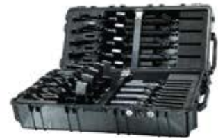
1780RF RIFLE CASE, 10 C7 & C8. Interior: 41.1 × 21.5 × 14.9", Exterior: 44.9 × 25.3 × 16.5"