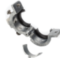
Split Bushing, Threadless, Insulated, Grounding (SGBTL383CL)

Used in situations where wires have already been pulled through conduit or EMT fittings, LUG #14-4 AWG 3/4, various sizes available.