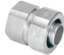
Raintight RIGID to Liquid tight Transition Fittings -Malleable Iron Body with Steel Ferrule (4370-LT)

For creating a Liquidtight/Raintight Connection between 2 different Raceways: 1/2" Rigid Conduit (GRC & IMC) and 1/2" Liquidtight Flexible Metallic