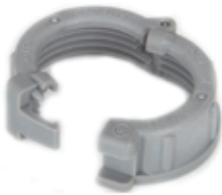
Nonmetallic Split Bushing (SB-383NM)

Used in situations where an insulated bushing is needed to protect conductors. 1". Various sizes available.